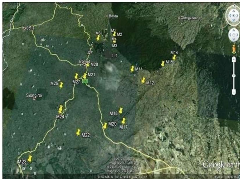
Figure 2. A Google earth map of Mara River Basin and sampling points.

1° 03' south and between longitudes 35° 01' and 35° 33' east (Figures 1 and 2). The area was heavily forested (UNEP, 2006, 2009) with typical equatorial natural forest trees, but parts have been converted to large and small scale farming and a buffer zone