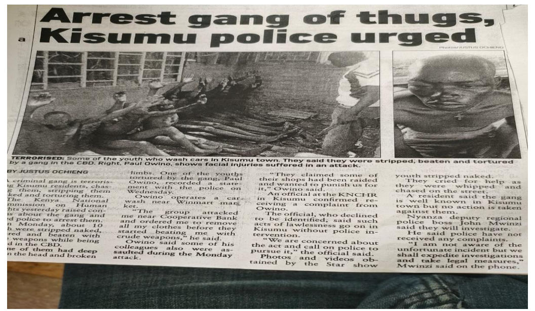
A violent gang strip and torture youths who operatd a car wash business in Kisumu's CBD

5.9 The Social Effects of Vigilante Groups on the Residents of Kisumu Plate 6: A Newspaper Coverage of Gangs terrorizing Kisumu's CBD.