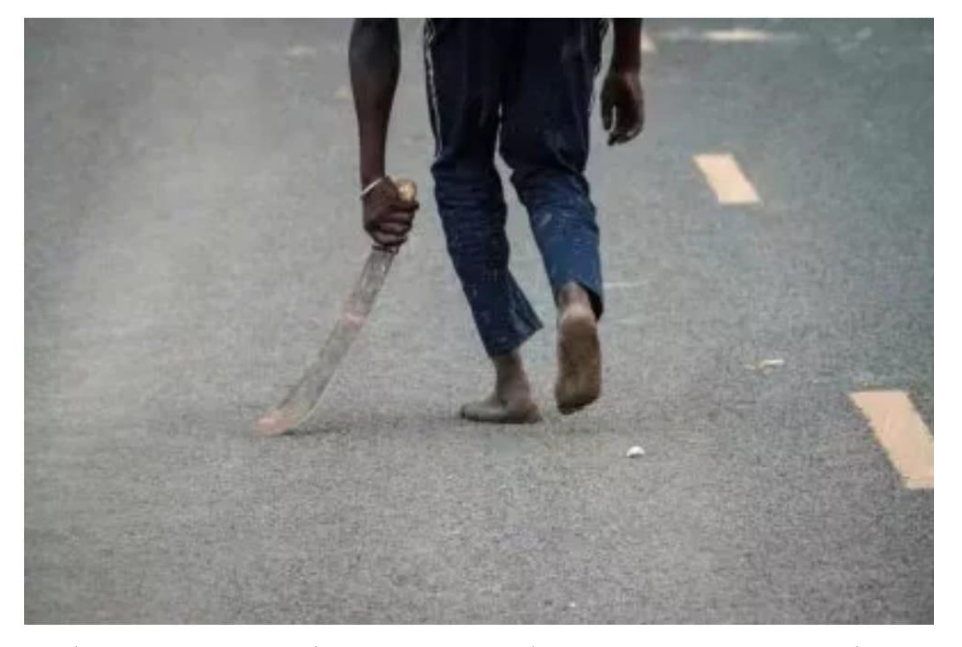
Vigilante group members in action during an insurgency along Kondele -Mamboleo Road in Kondel.

The opposition politics in Kisumu have often been attributed to marginalization, with funds purposed for development projects in Kisumu time and again channeled to other areas, thus retarding the development of Kisumu City. There are no new industries in the city, and the old ones have all collapsed, thus stagnating employment opportunities. There was also a feeling that government-sponsored groups such as KANU youth wingers were persecuting the political kingpins in Nyanza. To counter such treatment, the political class also began using their local vigilante groups. An ex-member of Baghdad Boys noted that with time, the group was able to attract very many youths who felt neglected by the State. According to the Kenya Crime Statistics Economic Survey of 2018 , Kisumu, with its bulging population of jobless youths, has over 20 different vigilante groups operating from different "Bases" or "Barracks." The groups go by various names, some local and others imported identities.