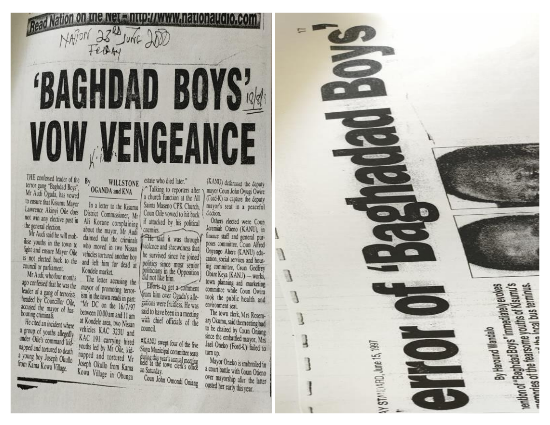
Headlines from various newspapers portaying the activities of Baghdad Boys in Kisumu.

During the struggle for multi-party democracy in Kenya in 1991, Baghdad Boys had their supreme leaders (K-005) and (K-0032). Later, China Squad and American Marine also had their leaders that is (K-016) and (K-0018) respectively. These vigilante groups produced visible leaders who were recognized by the local citizens as well as the politicians in the area. The vigilante group leaders received more recognition than the basic unit did. At the beginning, (K-005) was the leader of vigilante groups in Kisumu before the other groups emerged. To ensure proper functioning of the group there was need for a defined structure of leadership which was also driven by the need to have a clear link between the political elites