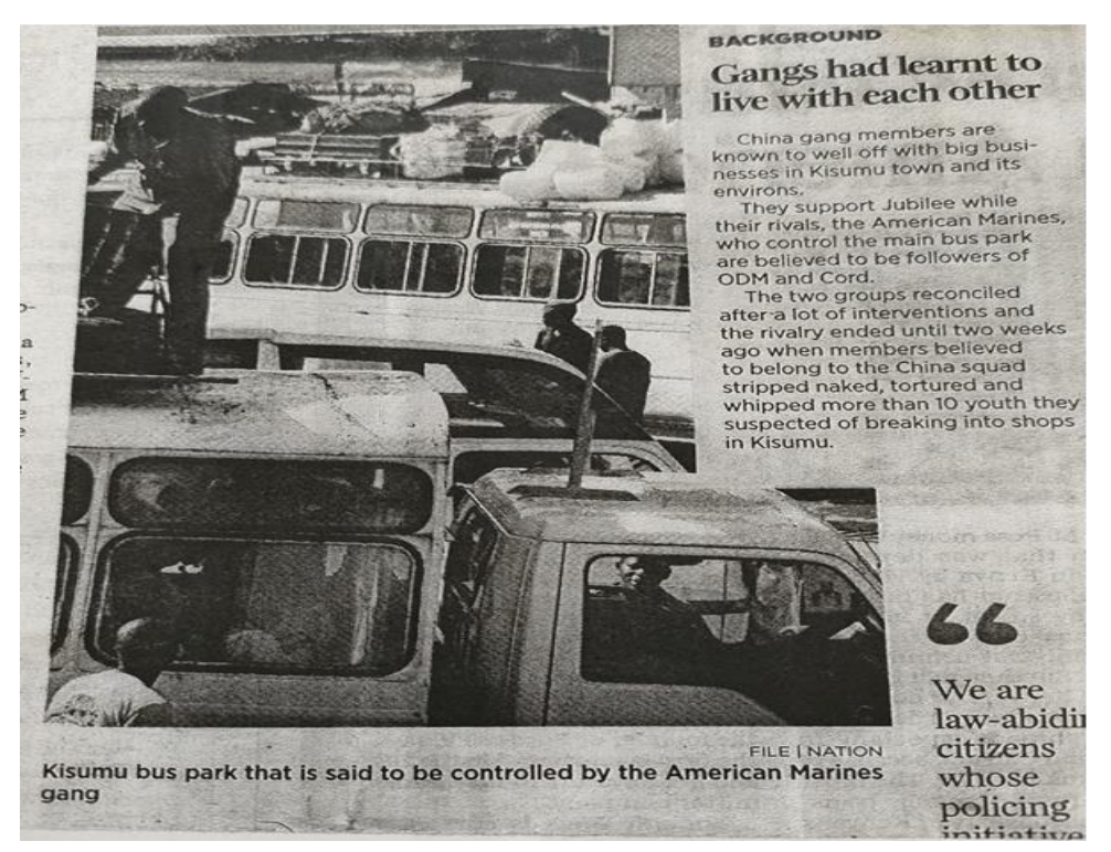
Activities at the Kisumu Bus Park which is said to be controlled by American Marines.

Informant K-036 (KII, 4/4/2021), approximated that the American Marines collected at least KSh. 20 000 per day per route, amounting to nearly Sh. 500 000 per day from all routes under their control. The group collected KSh. 250 daily from each 14-seater matatu , KSh. 300 from 25-seater minibuses and Sh. 400 from 65-seater buses. The monies collected from the bus park were used to start car hire and car wash centers. Informant K-019 (KII, 5/4/2021) told us that any threat to the business would be met with vicious response American Marine members believe that all the termini and bus-parks within Kisumu city belong to them, and so prospective owners of businesses near the bus terminus must first seek their blessings.