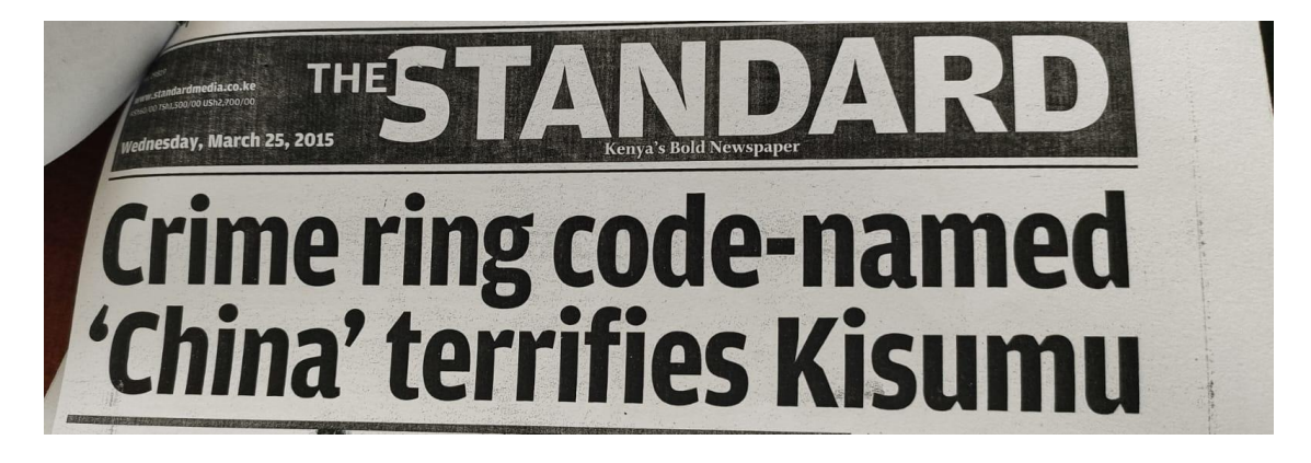
Vigilant groups in Kisumu City are portrayed as violent gangs linked with serious criminal activities.

A scrutiny of the security situation in Kisumu City and its environs shows clearly that there is an increase in insecurity and criminal activities (Reported Crime Statistics, 2015). According