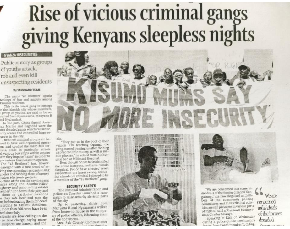
Residents demonstrate a long the streets of Kisumu City over rising cases of insecurity. Below is a couple in hospital nursing injuries sustained from a gang attack. Source: Standard Newspaper, September 25, 2015

The adherents of the vigilante groups in Kisumu instilled fear on the residents through beatings and harassment of those who questioned their operations. The fear prompted by vigilantism has led to behavioral change amongst Kisumu City residents. One Migosi resident interviewed confirmed that vigilante groups have created fear and intimidation among the city residents. Many city residents keep silent about the activities of the groups or speak in low tones to avoid the repercussions. For instance, during the interviews, the resident was quite apprehensive when asked questions regarding the operations of vigilante