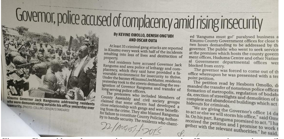
Kisumu City residents demonstrating at the governor's office over insecurity attributed to vigilante groups suspected to be funded by politicians and businessmen. Source: Standard Newspaper, August 22, 2015