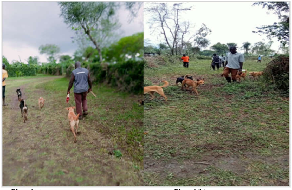
Plate 1(a) Plate 1(b) Plate 1(a and b):Hunting and Gathering Activity in Nyalenda and Sino Kogola respectively.

The above findings were supported by the results from the previous studies carried out by (Andy, Milner-Gulland, Ingram & Aidan, 2019) and (Nasi, Brown, Wilkie, Bennett, Tutin, Van Tol & Christophersen, 2008) which asserted that time taken by individual in hunting depends entirely on their economic power and that in times of hardship hunting act as economic guard. In as much as the outcome of these studies supported the findings of the present study, however, these studies focused on hunting for consumption on tropics and tropical forest respectively further, Andy et, al. (2019), studied on influences of hunting methods and effort on the types of animals caught in the Tropics. They did not document on how hunting and gathering as an anthropogenic activity affects both flora and fauna species. This gap was bridged by this present study.