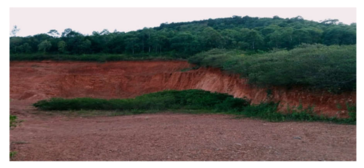
Plate 2:Marram Excavated Land at Wire Hills for Construction of Rural Access Roads and Oyugis Kendu Bay Road.