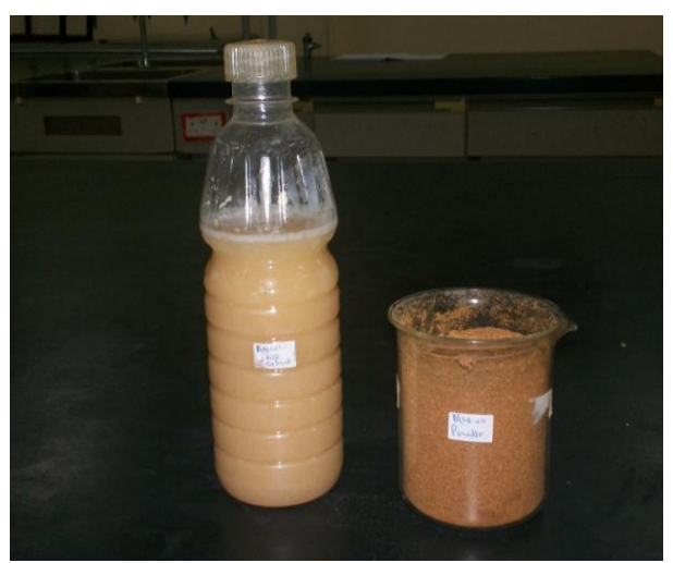
Fig. 1: Maerua subcordata juice extract and ground root powder

Juice extract juice was extracted from peeled and chopped tubers. Extraction was accomplished by the use of a ram press and brownish juice obtained was filtered off to remove suspended particles. The remaining tubers were peeled, cut into small pieces, dried in sunlight and ground using a 3 phase plant mill located at the mechanical Engineering workshop in J.K.U.A.T. The powder was then sieved with a sieve with an aperture of 0.5mm.