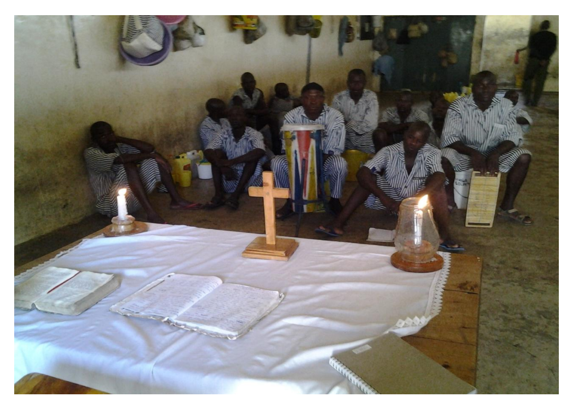
Figure 4.1: Plate 1: A worship place and inmate worshipers in one of the prisons

restoration of life in a place that for many feels like a dead-end. Men and women can be raised above their circumstances into the freeing world of faith and love through worship (The Methodist, 2019). In one prison, it was also noted that inmates did not have pews or even benches to sit on during worship. The below picture gives a glimpse of the state of worship halls: