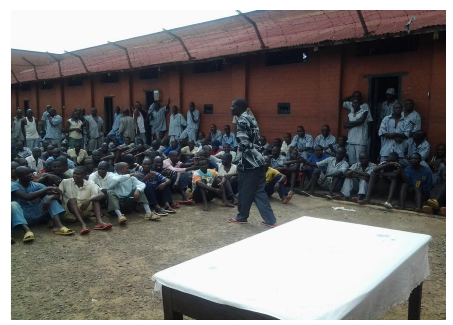
Figure 5.1: Plate 5: An inmate leading a worship service in one of the prisons of WKC

On being asked as to when inmates are given prison uniforms, an OIC 4 responded: Thats the first thing they receive on admission after inspection . He went on to explain that; where uniforms are in short supply chiefly because of overcrowding, we give them used ones while those who are older in prison get the newer ones.