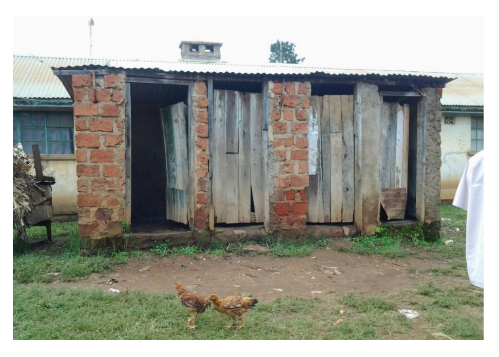
Figure 4.3: Plate 3: Prison latrines in one of the prisons