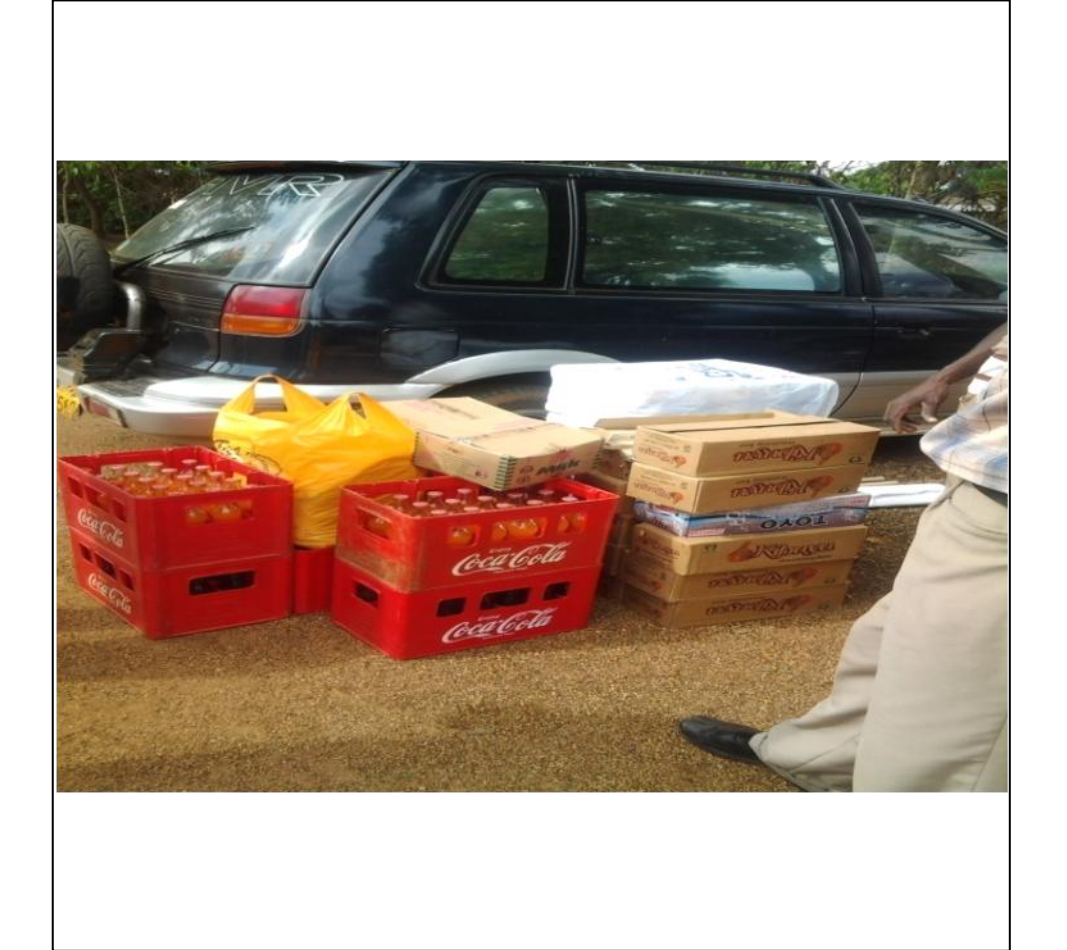
Figure 4.2. Plate 2: Donations from well wishers