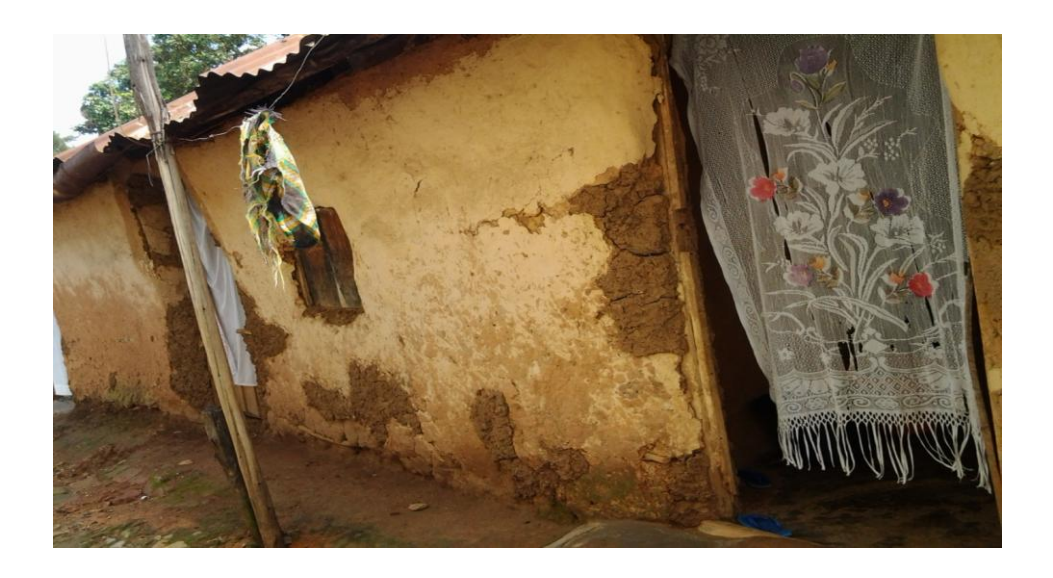
Figure 4.4. Plate 4: Chaplains house in one of the prisons

During one of the FGDs one of the Chaplains had this to say: