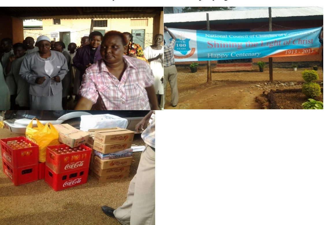
Figure 5.2: Plate 6: The NCCK members bringing female inmates food and supplies

The researcher counted in one of the wards 13 mattresses, whereas the number of inmates housed there was 108. Yet, in another ward, there were only nine mattresses with a population of 99 inmates. However, the female facility's sleeping conditions were better than the male facilities even though the problem of congestion meant sharing of mattresses. The only prison the researcher saw mosquito nets were in the female prison. However, the mosquito nets were grossly inadequate and were meant for children four years and below accompanying their incarcerated mothers.