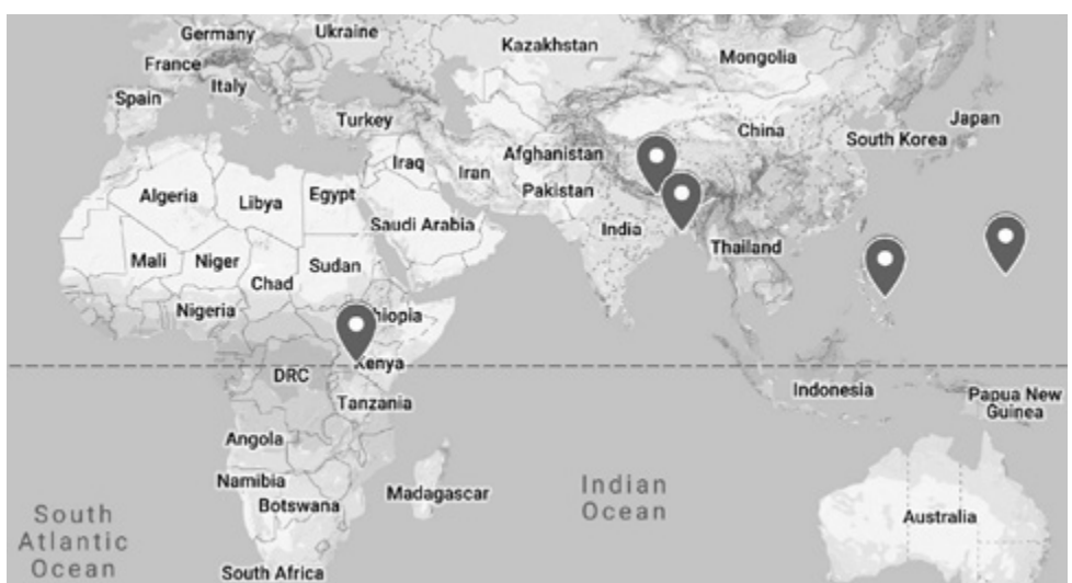
Figure 1. Map showing the location of the five case study sites

Low-lying Busia County in west Kenya experiences frequent floods as the Nzoia River makes its way towards Lake Victoria (see Figures 1 and 2). Combined with