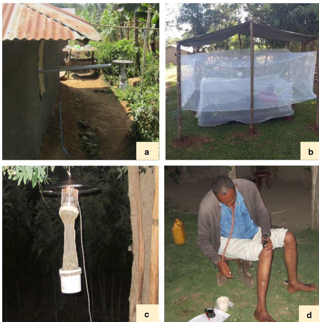
Fig. 2 Vector sampling tools [human-odour-baited CDC light trap (a), human-baited double net trap (b), unbaited CDC light trap (c) and human landing catch (d)] used for outdoor host-seeking malaria vector surveillance in western Kenya and southwestern Ethiopia

installed into the inner end of the pipe to enhance out-flow of the odour. A CDC light trap (John W. Hock Ltd, Gainesville, FL., USA) was set outdoor near the outer end of the pipe to capture mosquitoes attracted to the human odour. The pipe was connected from the sleeping room to the outdoor station through a small hole (2-in. diameter) made on the wall or window of selected houses. The length of the pipe from the wall of the house to its outer end was 2 m. The inner opening of the pipe was covered with untreated net to make sure that the pipe pumps odour only. The inner (wide section) of the pipe was connected with its outer (narrow) section using reducing bush so that the two parts could be easily disconnected when they were not in use. Outdoor host-seeking mosquito collection using the HBLT was done from 18:00 to 6:00 h during each collection night.