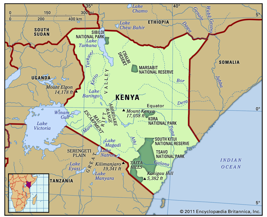
Figure 1: The map of Kenya and its geographical location.