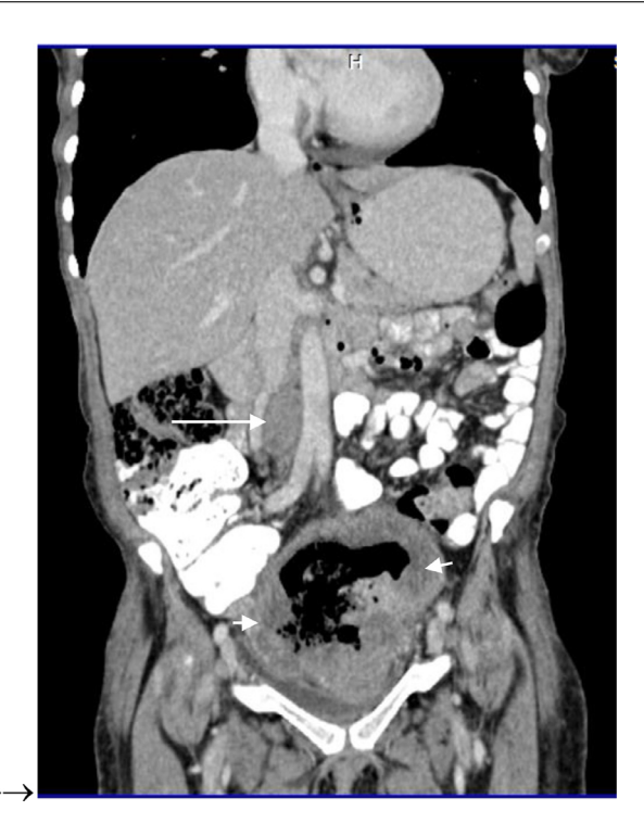
Fig. 1 – Case 1. Contrast enhanced CT of abdomen and pelvis coronal view showing colonic wall thickening and marked aneurysmal dilatation sigmoid colon [small white arrows] and aortocaval lymphadenopathy [white long arrow].