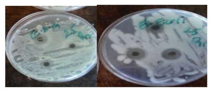
Plate 4. Showing growth inhibition zones of ethanol extract on S. aureus and E. coli respectively at 250mg/ml.