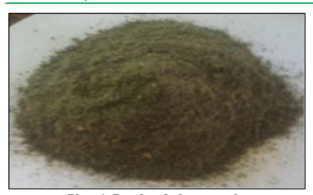
Plate 1. Powdered plant sample