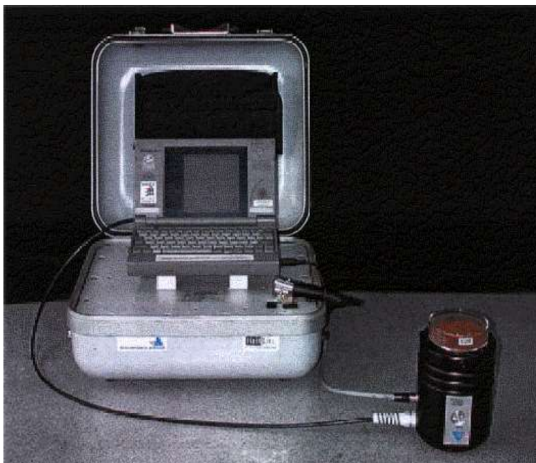
Figure 2: Field Spec™ FR spectroradiometer

distribution on the Petri dish floor. The intensity of reflected light, which is plotted as a function of wavelength gave distinctive patterns known as spectral reflectance signatures. The signatures were interpreted to generate data presented in tables and texts.