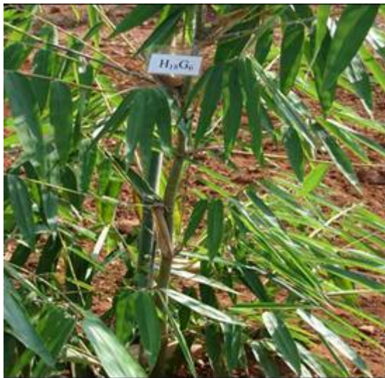
Plate 1: Giant bamboo tagged

To reduce sampling errors thereby enhancing sampling precision, 50% of bamboo clumps were randomly selected. The selected clumps were tagged with codes indicating the district (site), farmer's number, species and the number of clump selected for easy identification and monitoring of survival rates, culm numbers, heights and diameters, among other modeling parameters (Plates 1 & 2). Assessments of the bamboo performance parameters were carried out at an interval of 3 months from the time of planting for the first 2 years and later after every 6 months.