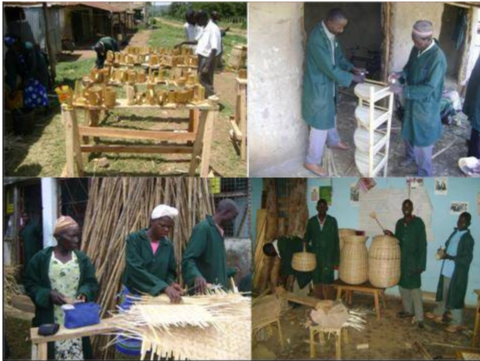
Plate 3: Project beneficiaries who were formally small-holder tobacco farmers

conducted by the Kenya Forestry Products Research Centre (which is part of Kenya Forestry Research Institute) staff courtesy of INBAR. The Trainers were formerly trained under the on-going East Africa Bamboo Project (EABP) being funded by Common Fund for Commodities through United Nations Industrial Development Organization (UNIDO). The two weeks training workshop per site was organized in strategic points in market centres where many local people could make observations on the potential of bamboo in changing rural livelihoods. The trainees were wearing green dustcoats with an advocacy message “ Stop tobacco! Start bamboo! ”, which proved very effective (see Plate 3).