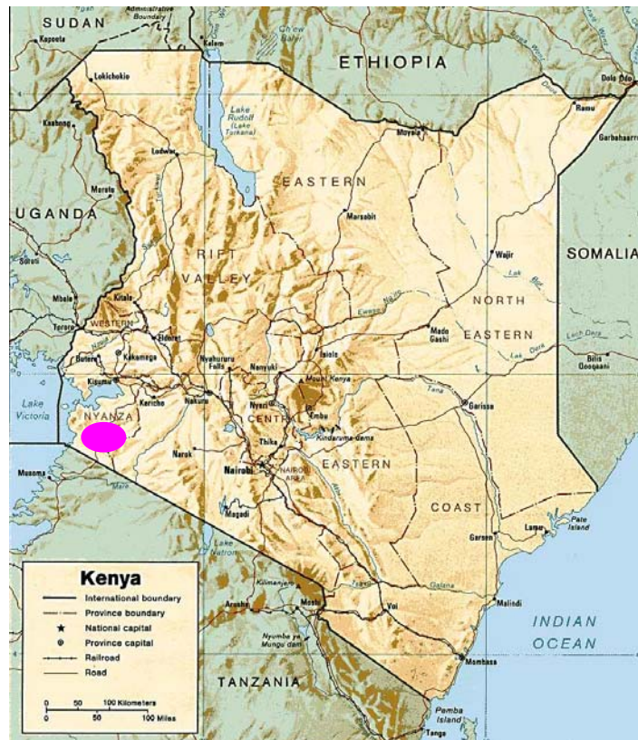
Figure 1: Location of the Study Area

The study was carried out in Kenya in the four (4) districts of South Nyanza region (Migori, Suba, Kuria and Homa Bay) (Figures 1 & 2). The region is located in south-western Kenya, and covers an area of about 7,778 sq. km, which is 48% of the Nyanza Province's land area. This region is mainly inhabited by the Luo and Kuria communities. Majority of the rural population depend on agricultural crops such as tobacco, sugarcane, maize, sorghum, sweet potatoes and cassava among others.