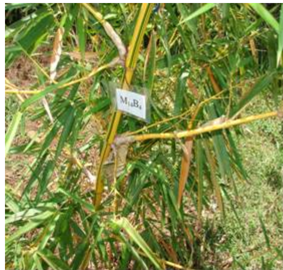
Plate 2: Common bamboo tagged