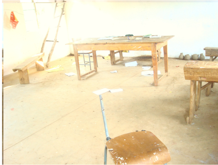
Figure 2. Art room with rudimentary facilities (A).

encourage and advice students talented in Art and Design to pursue the subject to the highest level due to the many career opportunity associated with it such as product designing, jewelers designers, curio artistry, toy making, cartoon making, basket making, puppeteer, interior designing, Art teaching , graphic designing, website designing, advertising and marketing artistry, art critiquing, printing, painting, sculpting, landscaping, illustrating, Film/T.V video graphic designing, photographing, animation artistry, theater designing, forensic artistry, stage managing among others.